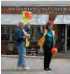
Royalton Lions Club