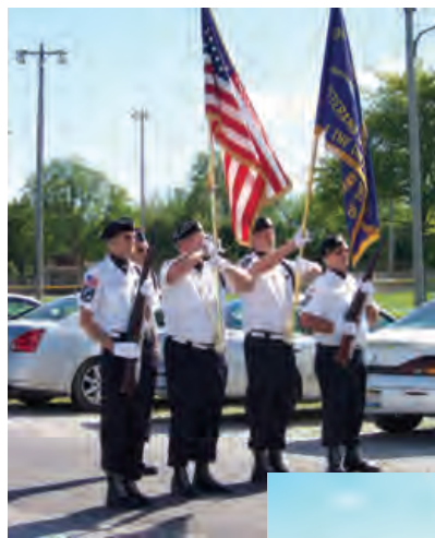
Local Veterans present our American Flag before Walk begins