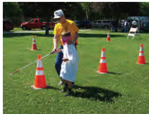
The Visual Obstacle Course proved to be a real challenge for all ages.