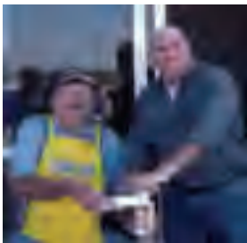
Princeton Lions Club