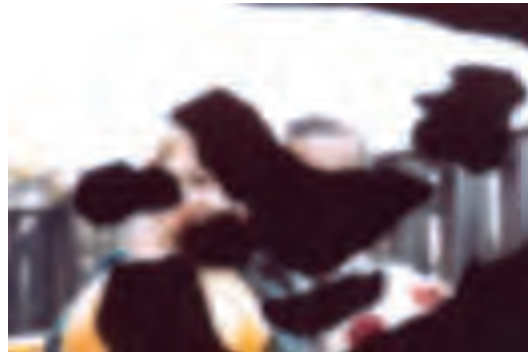
Same scene viewed by a person with diabetic retinopathy