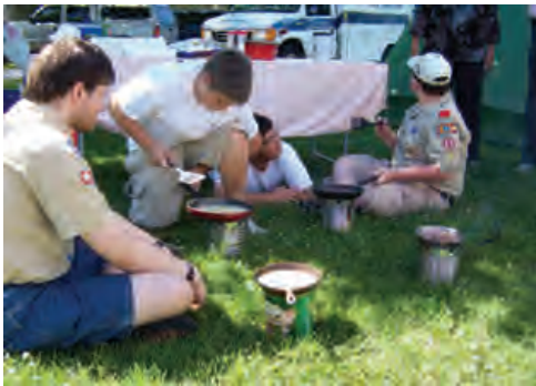
Local Scouts provided spectators camping demonstrations.