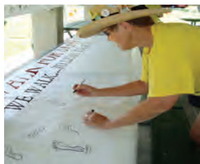
After crossing the finish line walkers signed and stamped a footprint on a memory banner for the Walk