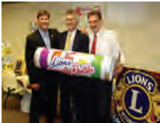
Lombard Lions Club