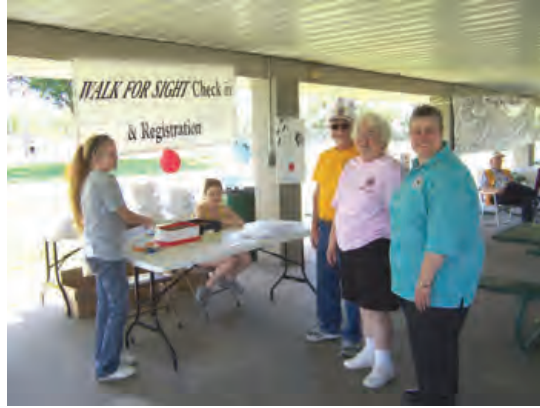
Registration Team members stand ready for walkers.