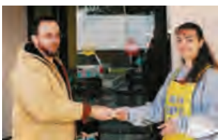
Girard Lions Club