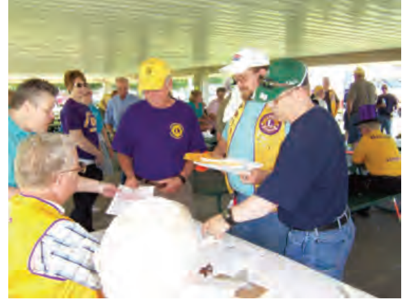
Walkers submitting pledge sheets