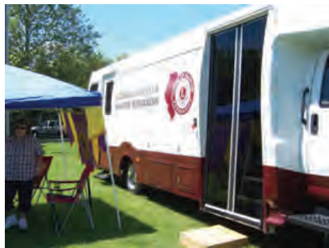
Tours of LIF Hearing Screening Van were offered to all.