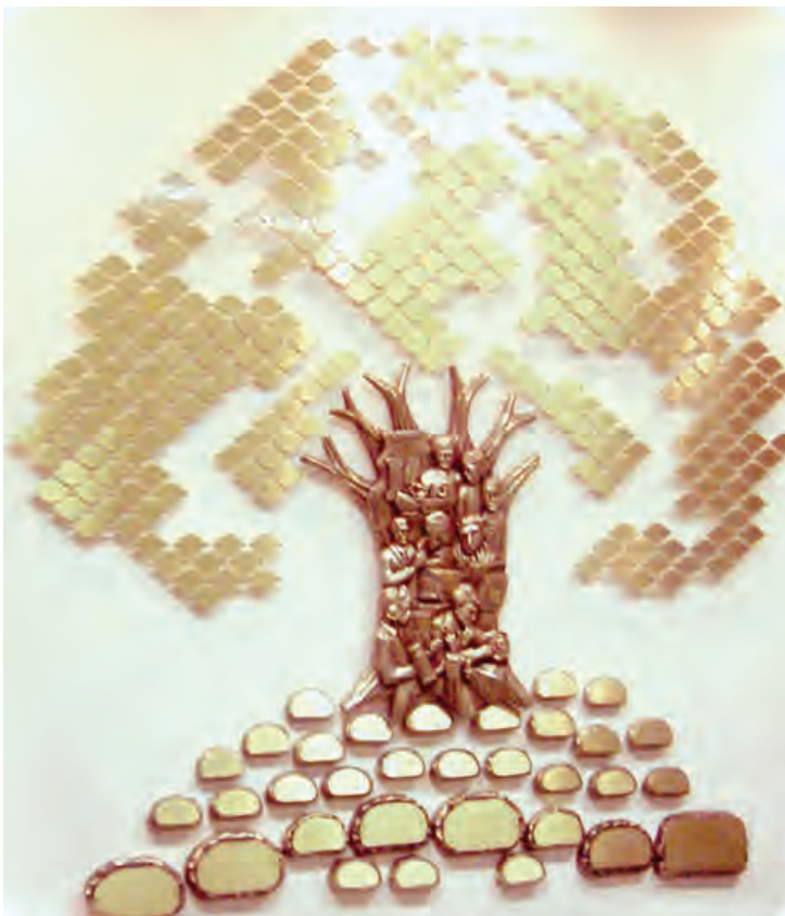
The Tree of Service is a monument to our “family” of Lions. It’s branches & rocks display the memorials, well wishes, and life events of our LIF members and supporters.

As you gaze at the trunk more images appear - a deposit box for eyeglasses,