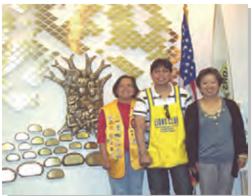
Three members of Chicago Bayanihan -Sampaguita Lions Club who stopped by the LIF Offices to deliver used eyeglasses and see the Tree of Service.